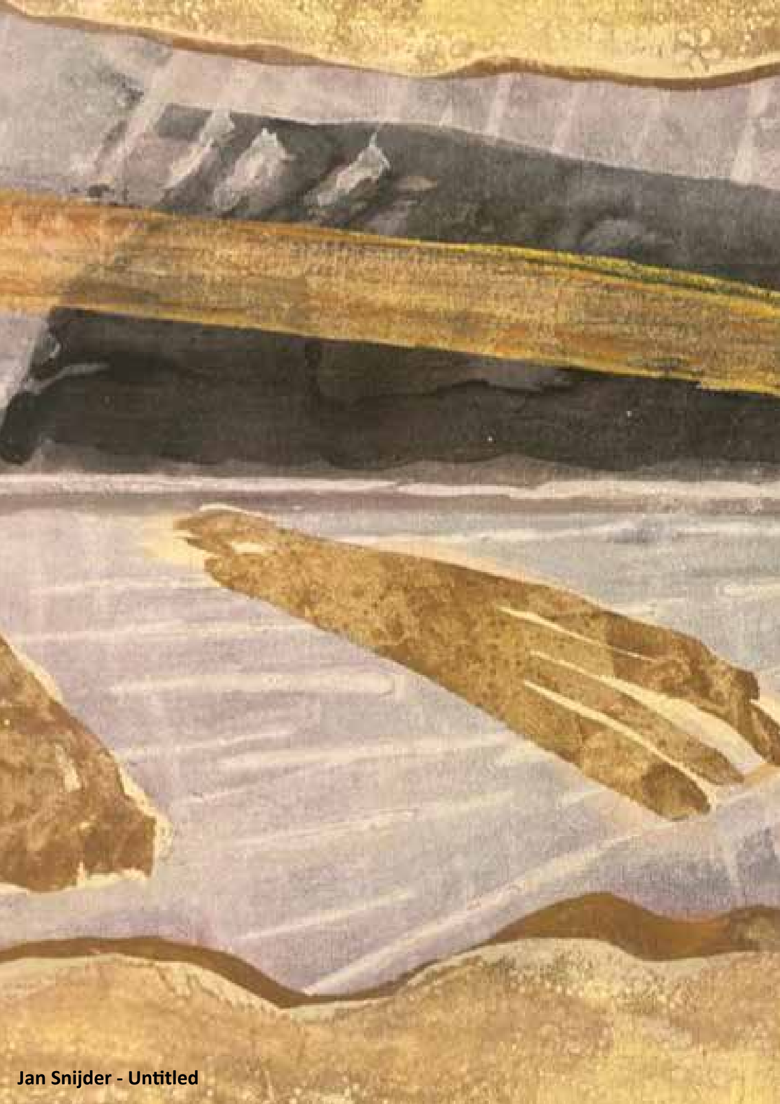
Jan Snijder - Untitled