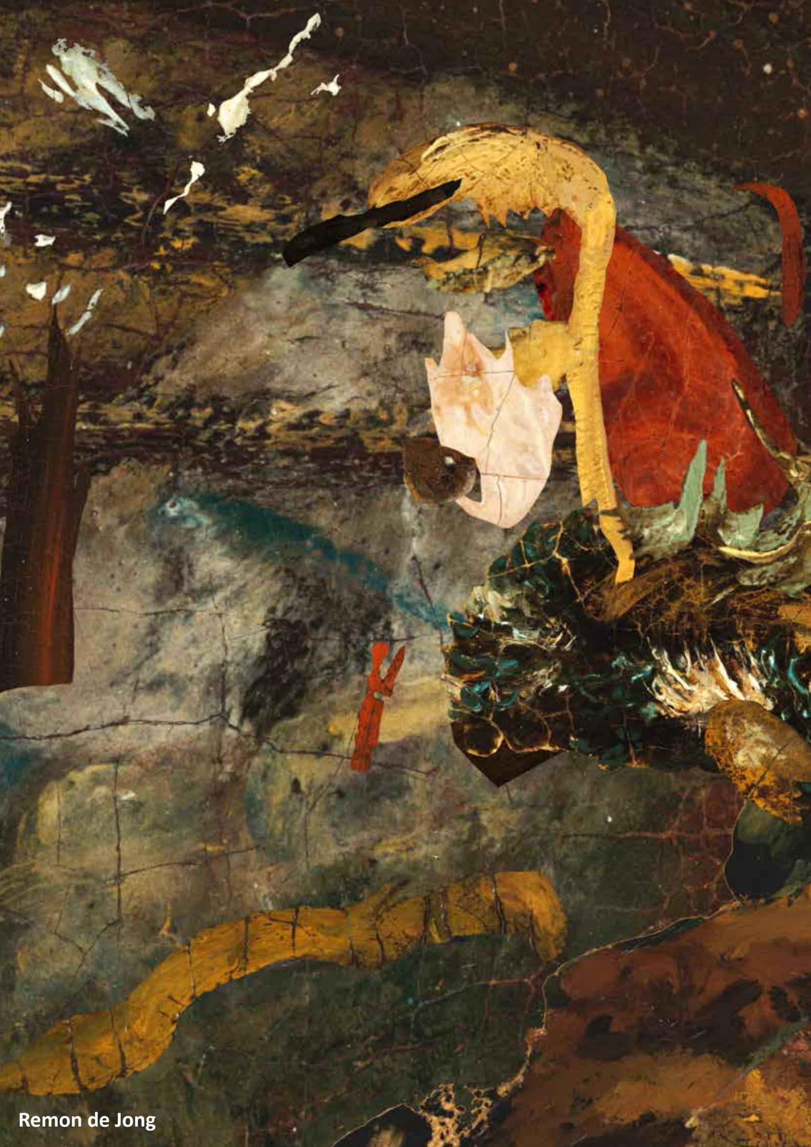
Remon de Jong