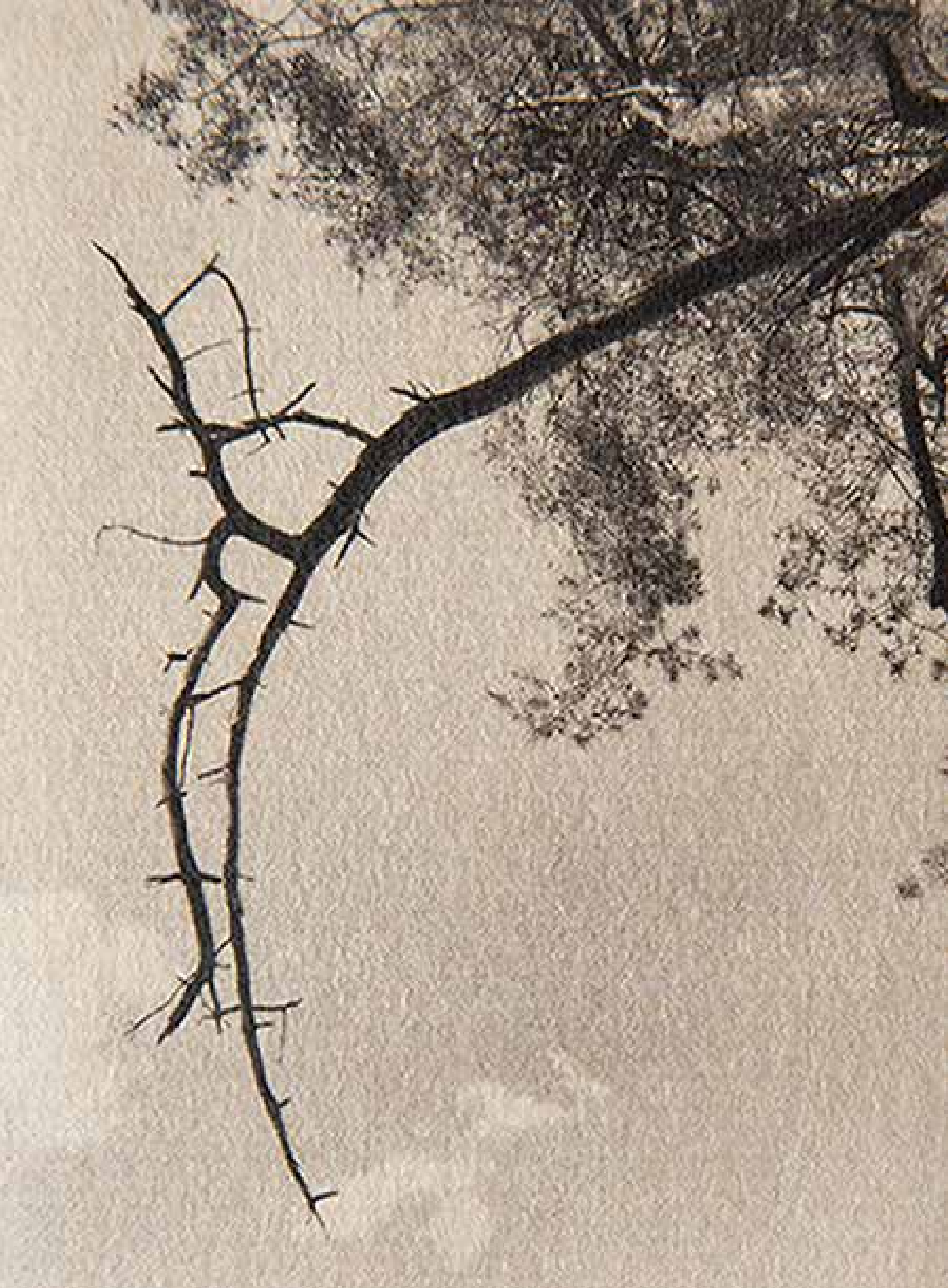
Emily Bates - Silently, you stood and watched me fall