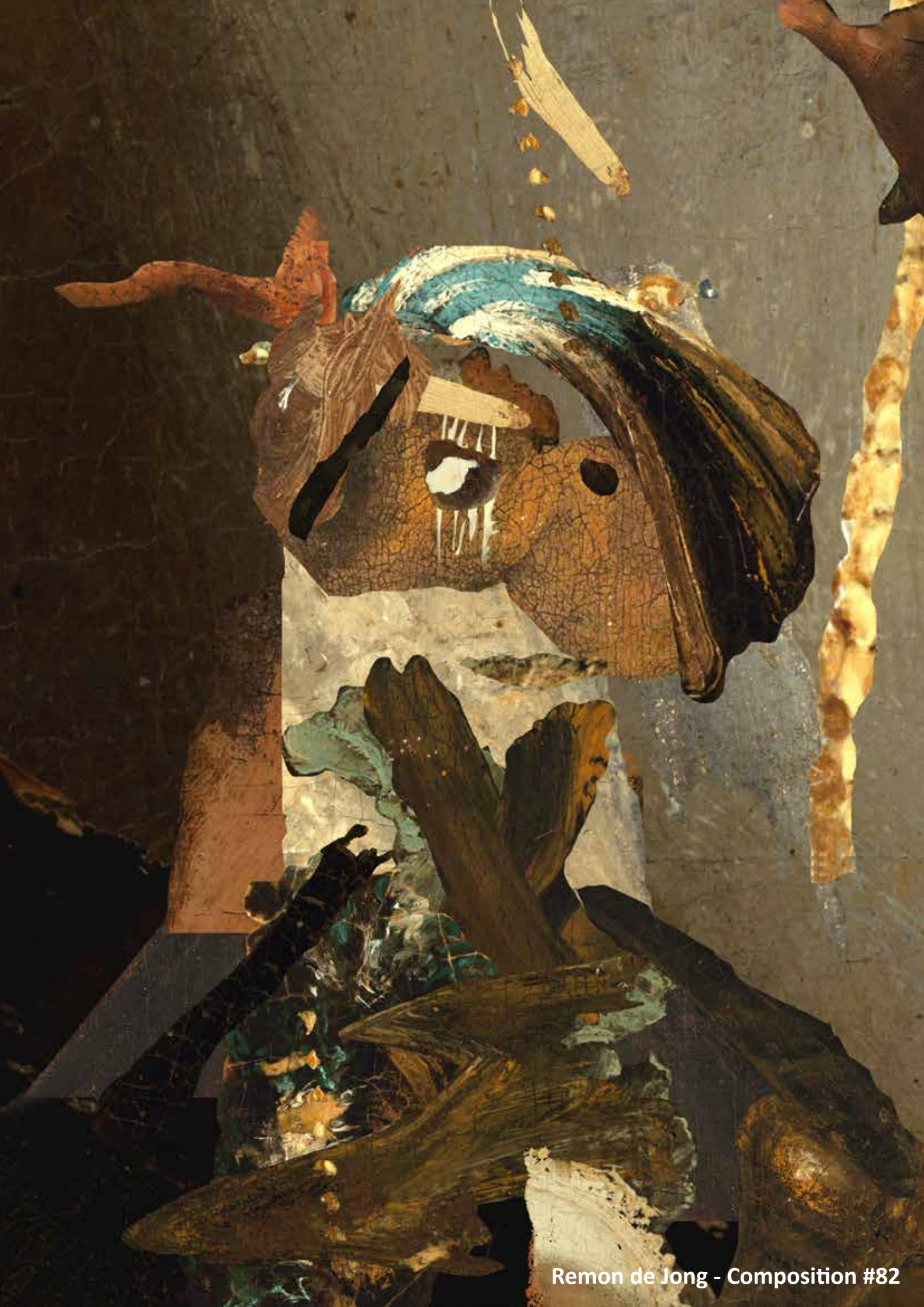
Remon de Jong - Composition #82